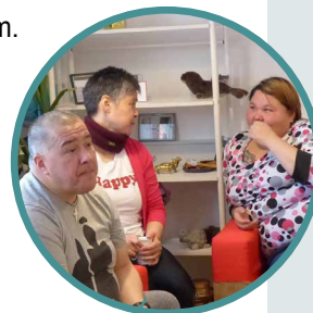
After the service

God’s Spirit used the simple Bible lessons to speak deeply to her heart. These are moments that we cherish very much and I realize afresh how God wants to change lives and how strikingly He begins by coming to living inside a person. We hope that she keeps coming and will learn how she can live with Jesus.